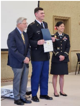
Photo (at left) is of the Vanderbilt Army ROTC awards program on 20 April 2023.

The chapter continued its support of 13 JROTC and 3 ROTC programs in the Middle TN area. Outstanding cadets in each program received MOAA certificates and medals signifying their achievements and potential to serve as outstanding military members.