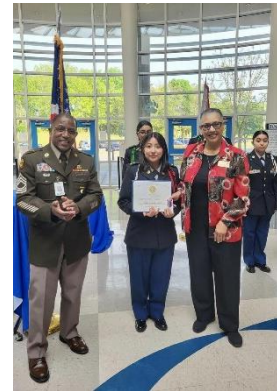
Photo (at right) is of the Antioch High School Army JROTC Awards program on 13 April 2023.