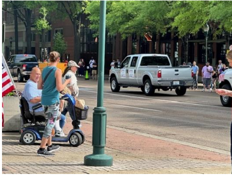
Armed Forces Parade